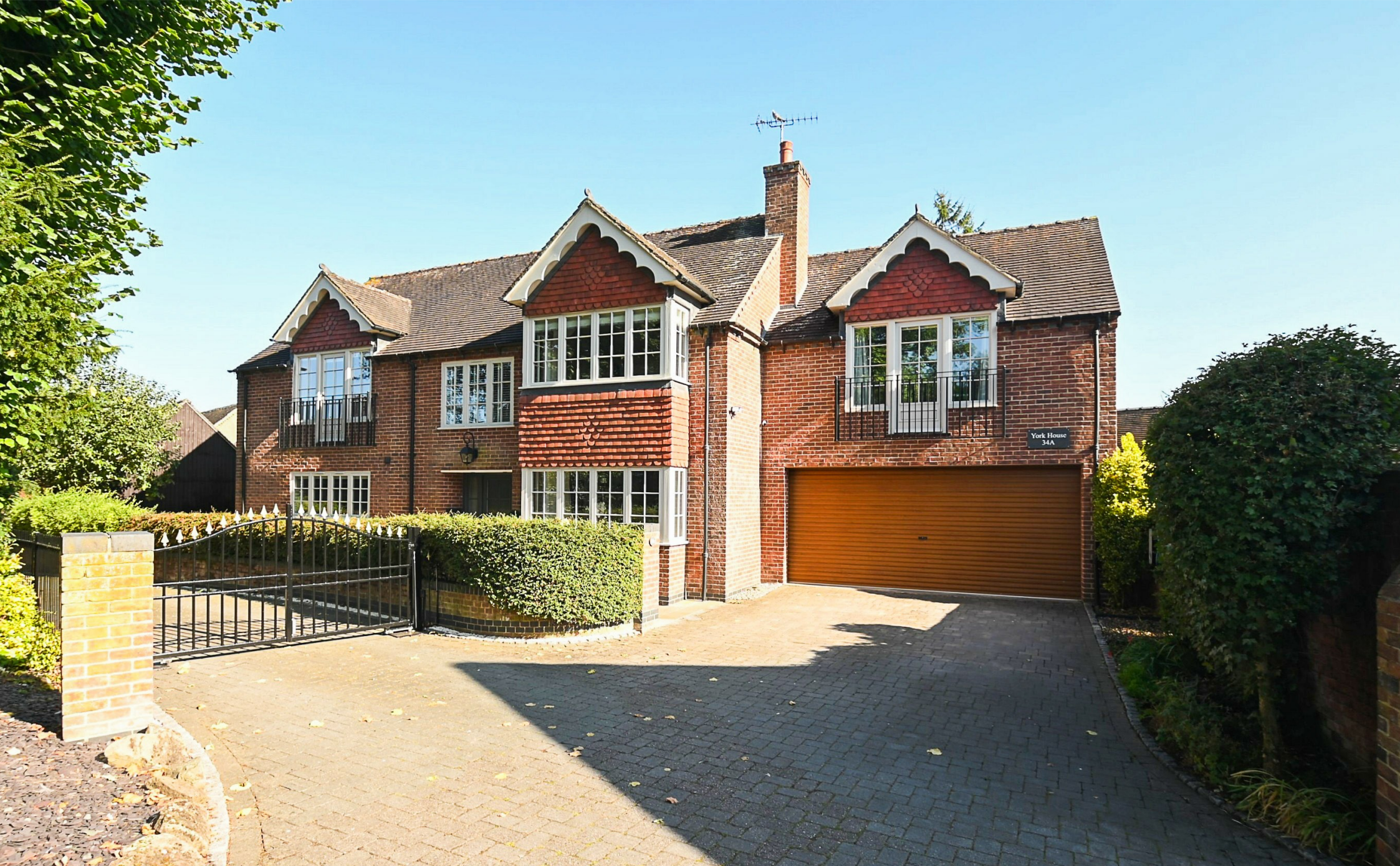
York House, 34a High Street, Tutbury, DE13 9LS